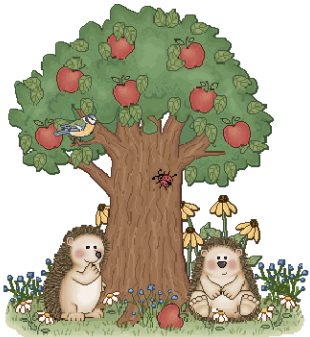
Lots of Cuddles & Care